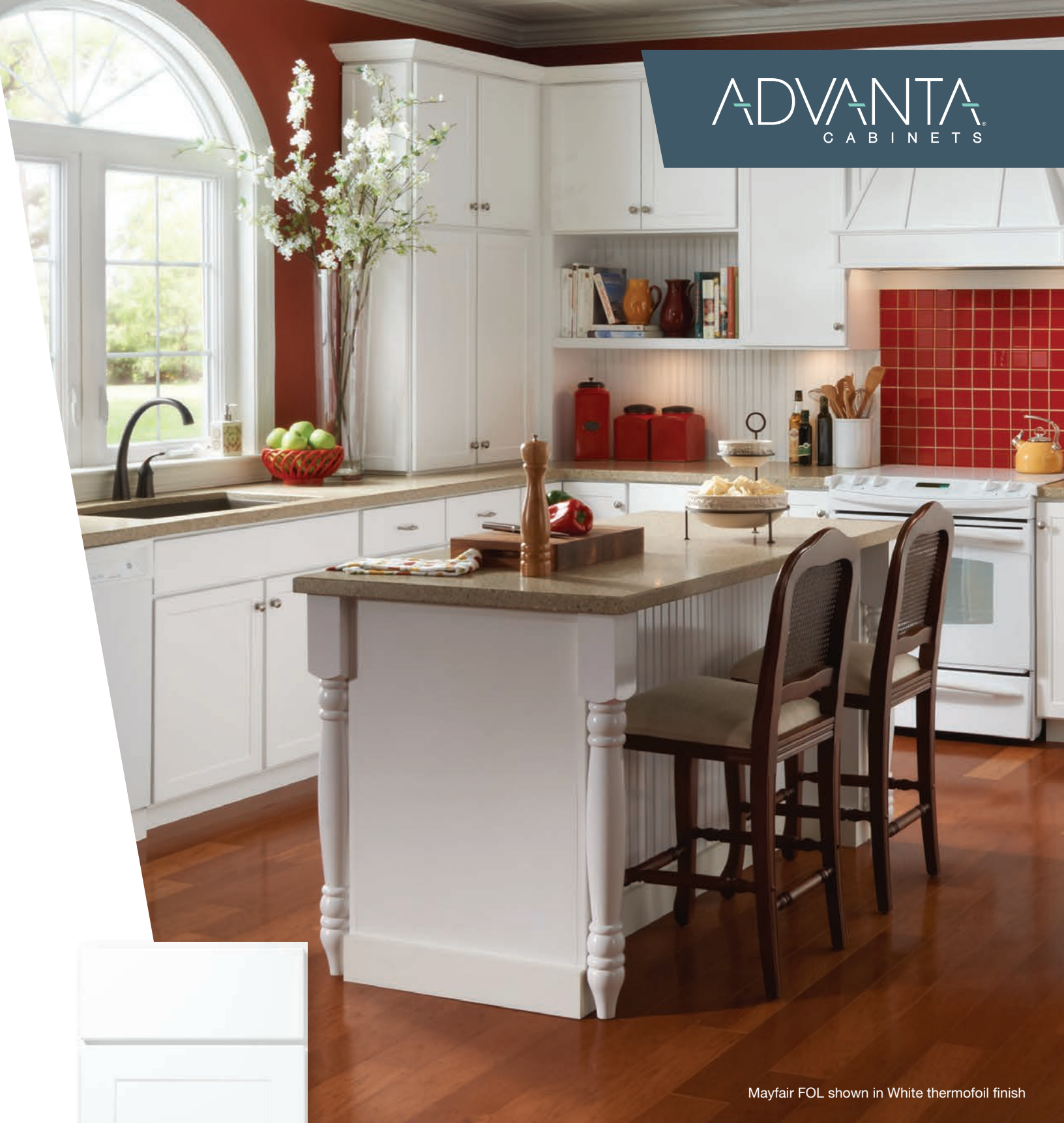
Mayfair FOL shown in White thermofoil finish