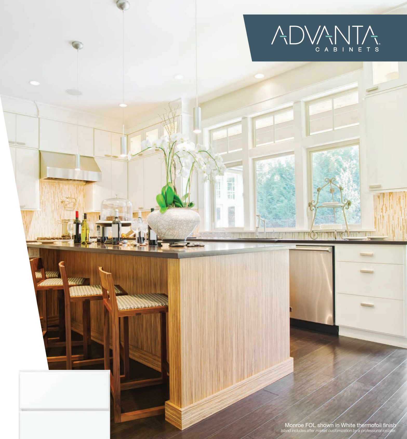
Monroe FOL shown in White thermofoil finish Island includes after market customization by a professional installer.