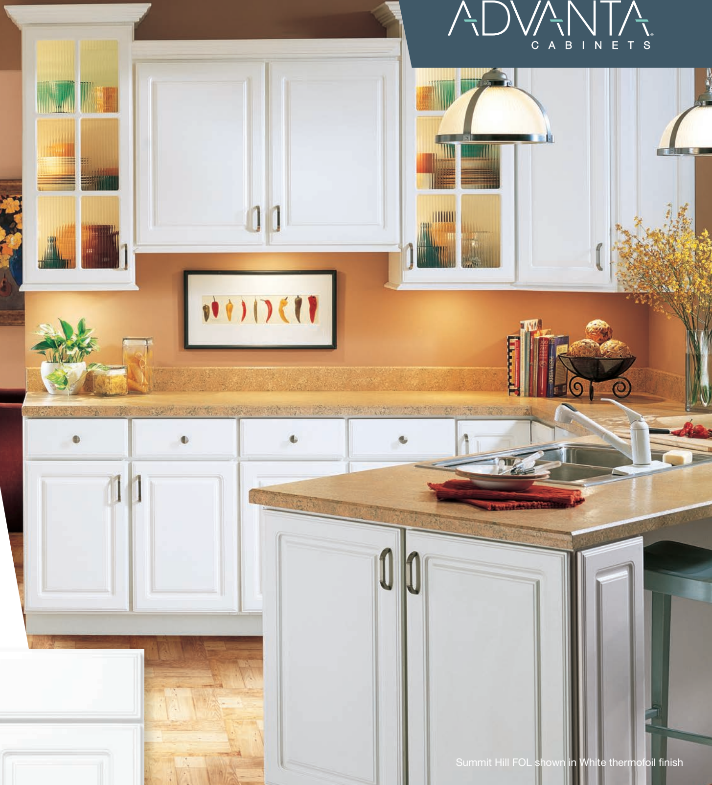
Summit Hill FOL shown in White thermofoil finish