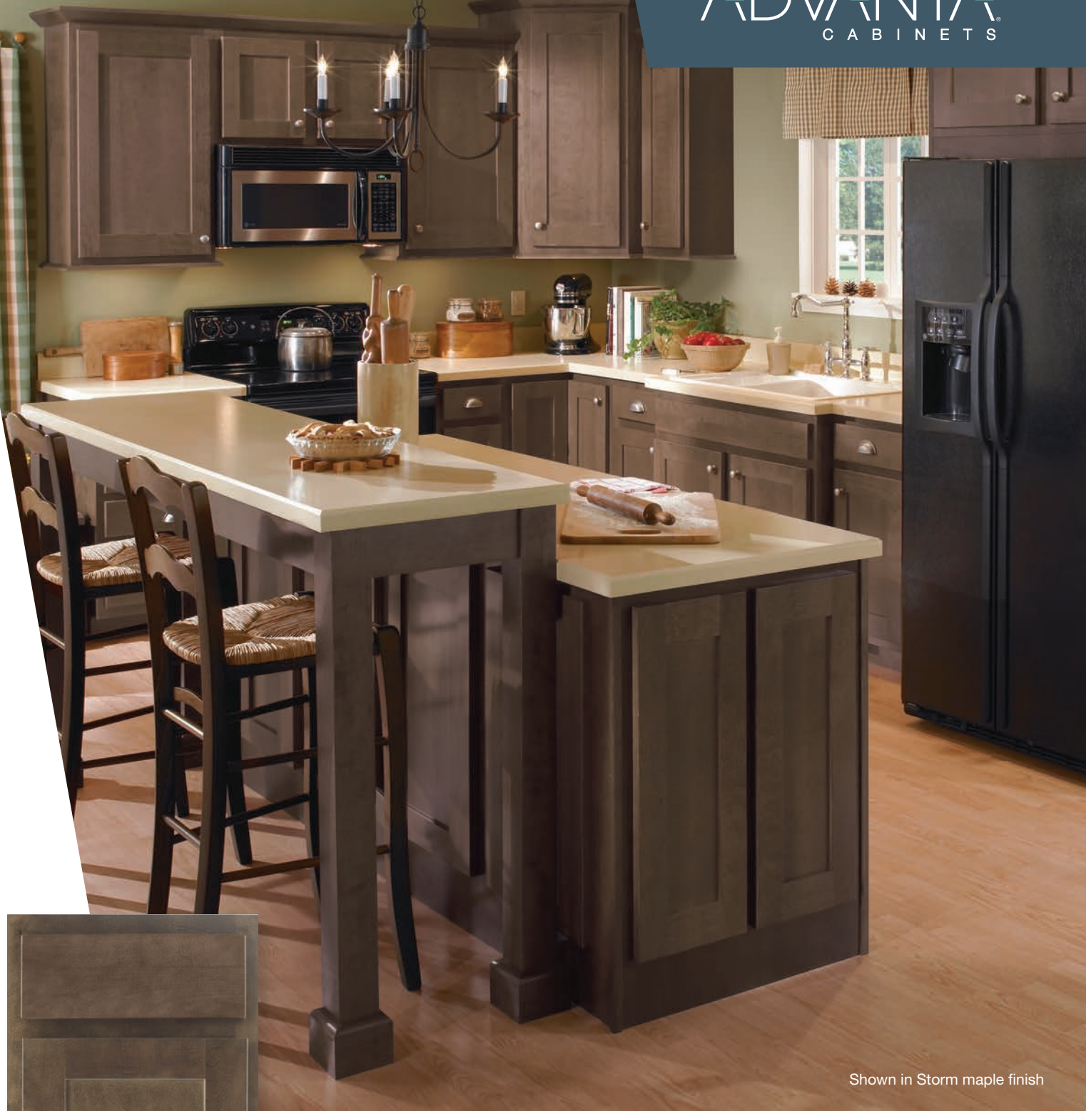
Shown in Storm maple finish