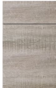
Aged Oak Gray